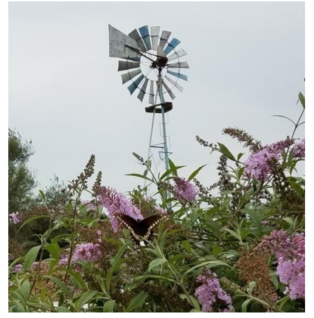
April – Butterfly Bush by Percilla Crockett