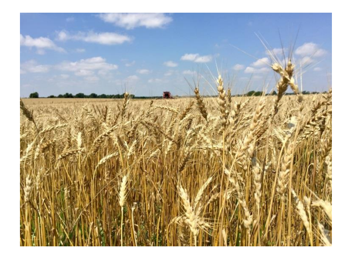
June – Wheat Harvest by Hailey Rook