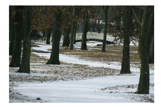
January 2018 - Snowy Path by Judy Gastel